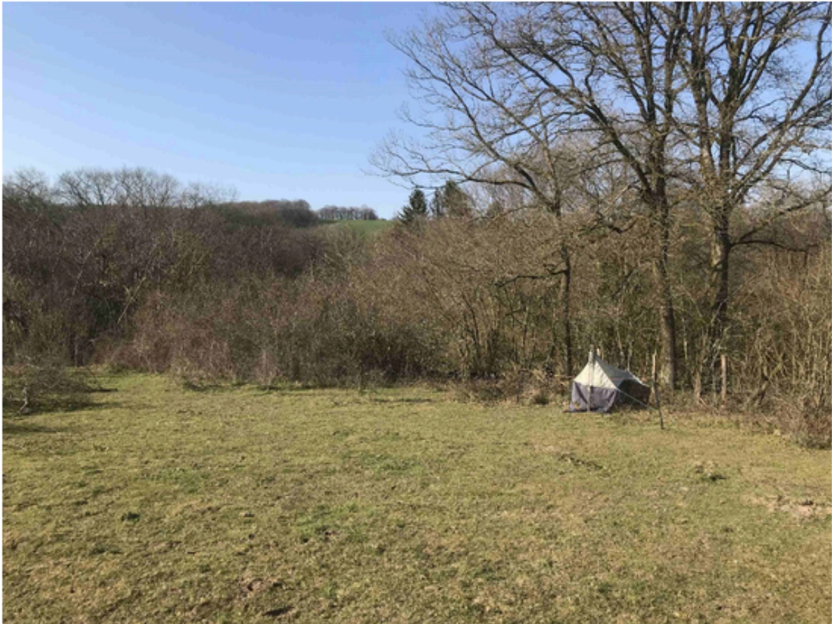
Figure 2 : Malaise trap installed in a meadow at the edge of a forest.