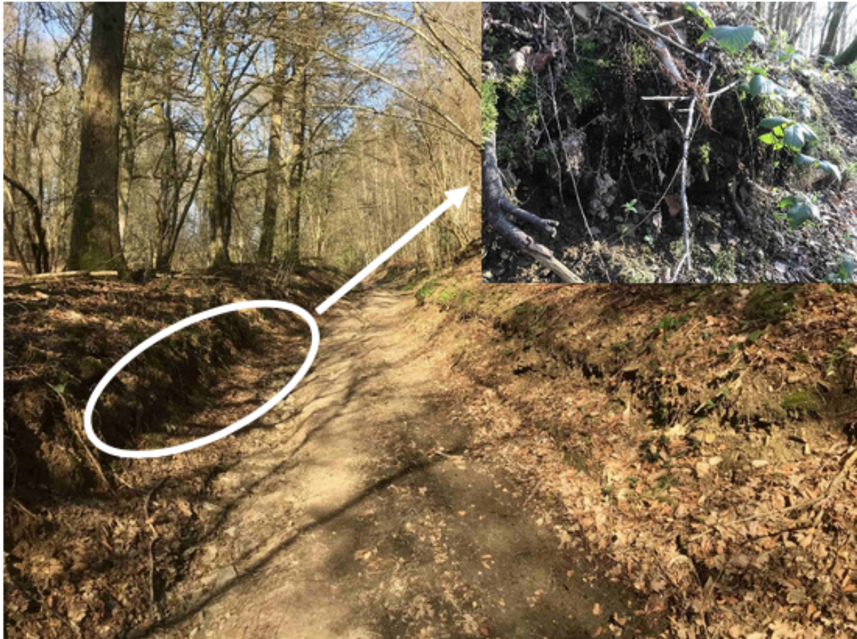
Figure 3 : Steep damp overhanging banks of a forest path.

This last habitat was mentioned as interesting by Hutson et al. (1980).