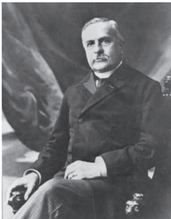
Figure 1. Albert de Lapparent (1839-1908) French Geologist, professor at the “Institut catholique de Paris” and perpetual secretary of the Academy of Sciences of France. He introduced in 1893 the term “Dinantian”.

Also in 1893, Munier-Chalmas and de Lapparent published a « Note sur la nomenclature des Terrains sédimentaires » in which (p. 448) they refer the creation