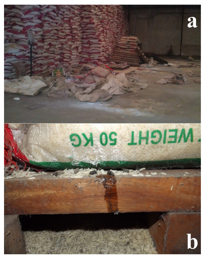
Figure 2. Images de l'intérieur des entrepôts du Port Autonome de Cotonou avec (a) des piles de sacs de riz, (b) du riz jonchant le sol et des fèces et de l'urine de rongeurs — Pictures of inside Cotonou seaport storehouses showing (a) rice bags piles, (b) wasted rice on the floor as well as rodent urine and feces.

Four dock warehouses (120 x 80 m), all located in AHC zone 1, were selected for the evaluation of rodent-induced economic loss due to damages to stored food. Three of them were public infrastructures (warehouses wh1, wh2 and wh3; Figure 1 ), with poor light and floors covered with cotton and rice wastes (see Figure 2 ). Rodent dead bodies were visible and rodent feces were numerous. In these buildings, rice bags were stacked on pallets, thus leaving a space between the floor and the goods piling as well as between wooden boards of the pallets. Piles are up to 7 m high and located around 1 m away from the walls. The fourth warehouse (wh4) was managed by a private company and looked cleaner, with less waste and no