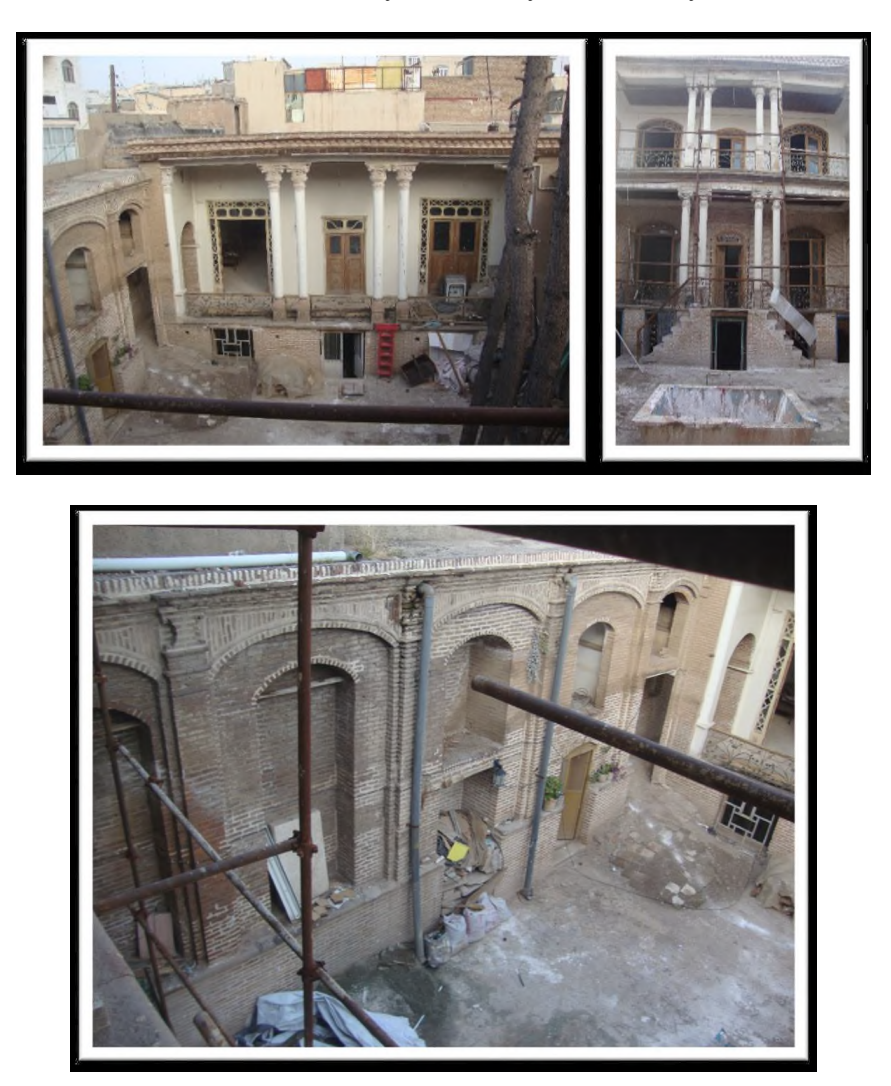
Photos from different views from Jalil Arazi house

In these houses, yards are located at the center and functions like a heart for the house. Different houses such as façade, balcony, corridor, moonlit, and podium are located by defined arrangement. All these are connected to the yard directly or indirectly.