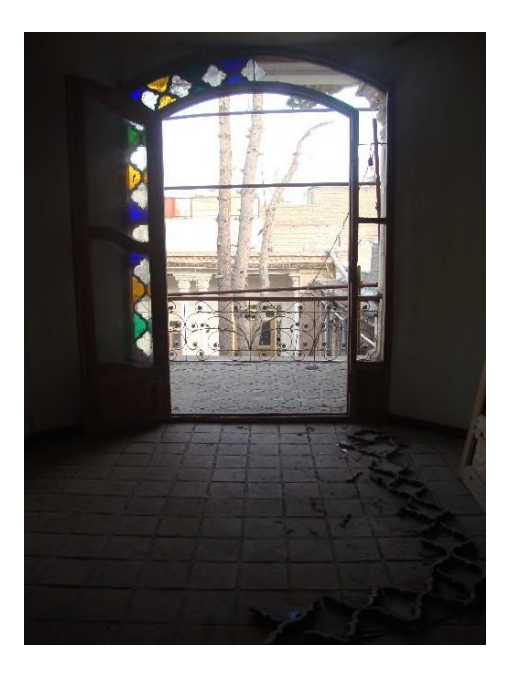
A sample sash window in Jalil Arazi