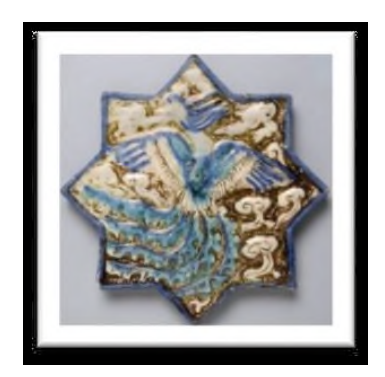
A sample of Ghajar Tiles

Tile is one of the fine methods is all lands of Islamic area. The development of tiling started from the small elements sticking to external brick facades of buildings and attained its highest points in eight's and ninth's era. Iranian tile especially that of Islamic era is well-known worldwide. Western art affected Ghajar tiling deeply; New paintings known as "London flower" is designed in tiles this era that was not common before. Some colors are also unprecendented. The designs of these tiles are mostly derived from nature. In Ghajar era, a relative evolution happened in painting and subject of them. Most of the tiles include historical subjects or everyday life of the court. One of the innovations of the era is the use of the color red in tiling that was not common before. Glaze is one of the main parts of tile. It is a glasslike cover featuring two actions: decorative and functional ones. Not only are glazed tiles used for decoration, but they also protect the building against humid and water (Bemanian, Momeni, Soltamnzade, 1390).