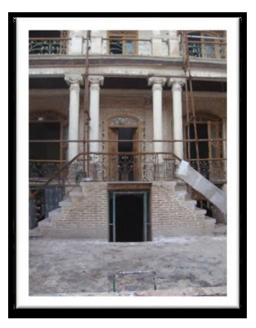
Jalil Arazi House