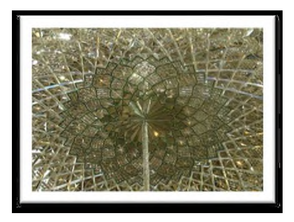
Mirrorworks of Ghajar dynasty