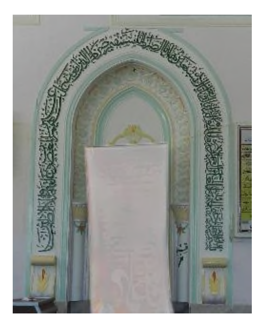
Picture 9: Plaster decorations of altar and above additional eastern mosque walls (source: writer).

Hamd has been known as paramount and noblest Sura. Because God equals it to great Quran in verse of 87 in Hejr sura, and the other is that the sura must be read in prayer and other suras cannot be replaced [9].