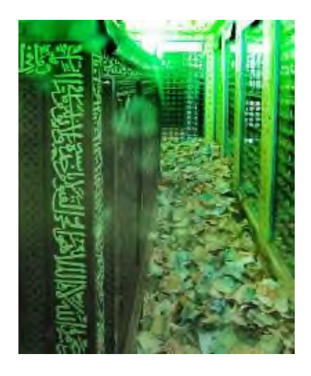
Picture 5: Wooden tomb box into metal adytum (835 Hejria, 1432 ad) (source: writer).