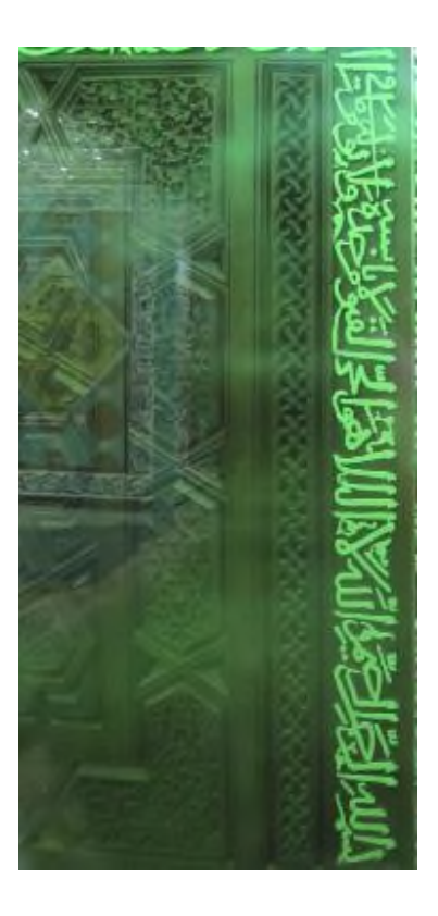
Picture 10: The part of tomb box inscription, third line, wood carving, and the beginning of "Ayat al Kursi".

"Ayat al Kursi" is known as Quran slogan and message due to existence of precise and fine education in the verse that is pure unity which shown by "Allah is he besides whom there is no god" statement therefore god name repeated 16 times and represented his attributes. "Ayat Al Kursi" comprehensiveness to God relation with his creatures special with human caused to excellence of it on others and persuaded commentators to explain it by special attention or write about this independent writings. A correct narration that considers the verse included greatest name of god which god be read with it, every praise accepted. Prophet quotes about virtue and status of the verse that the verse is paramount and most important of Quran verses [13].