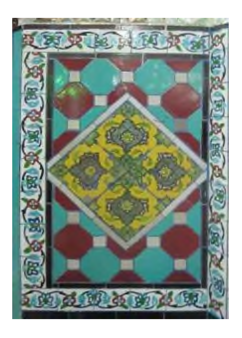
Picture3: Tiling plinths in interior view.

According to what remained today in internal view of the monument, tile used only in plinths (picture 3). According to being two types of tiles, it can be find that some tiles belong to Qajar dynasty and most of what seen in plinths has been used in next periods most likely due to injured and poured tiles. Different types of one color and seven colors tiles used in the section in form of main text and margin. Central diamond Square has combined in different colors with four lingwort and arabesque combinations among one color tiles with square and octamerous geometric shapes. Margin consists of lingwort flowers on white background.